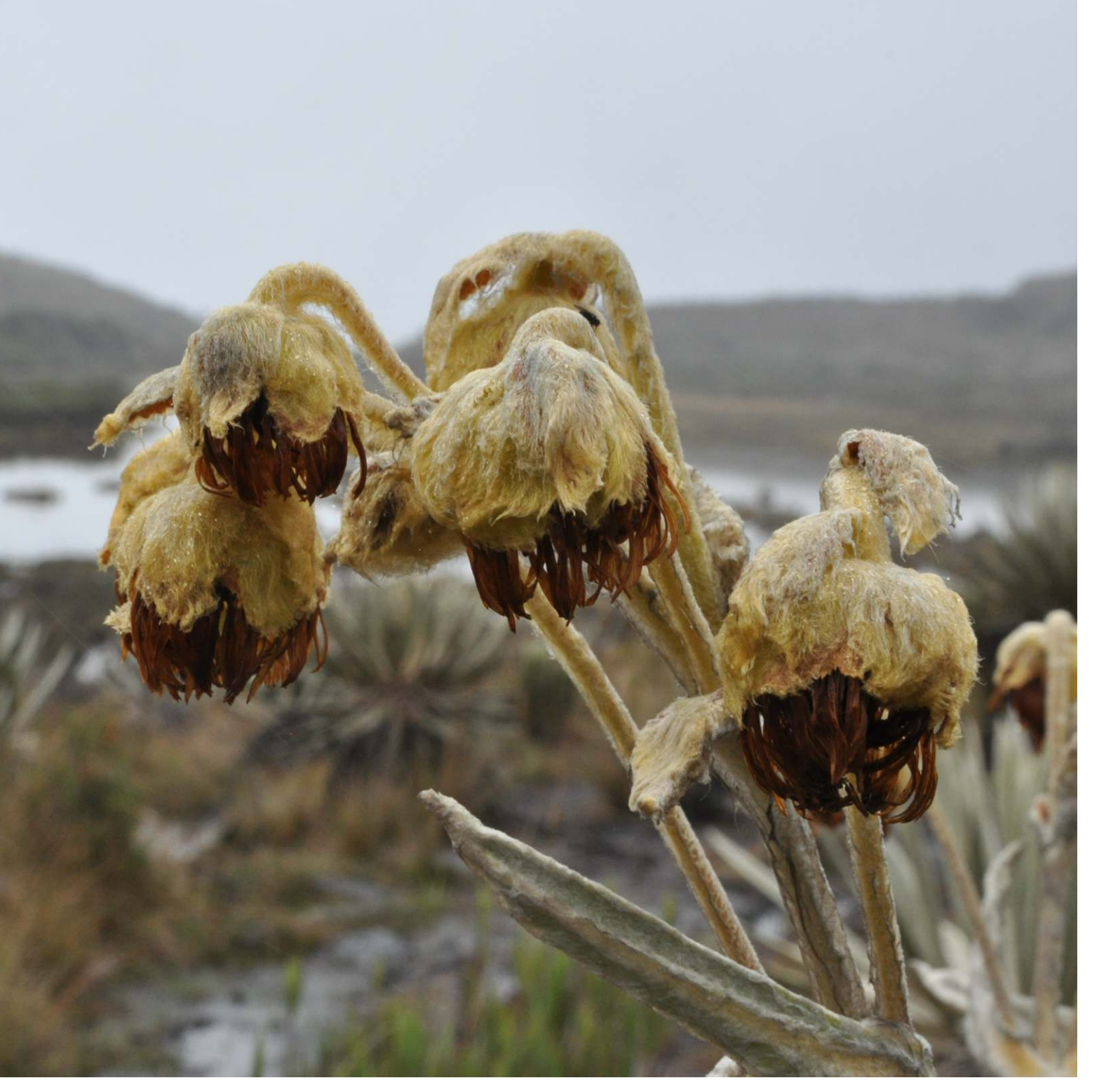
Chingaza Natural National Park